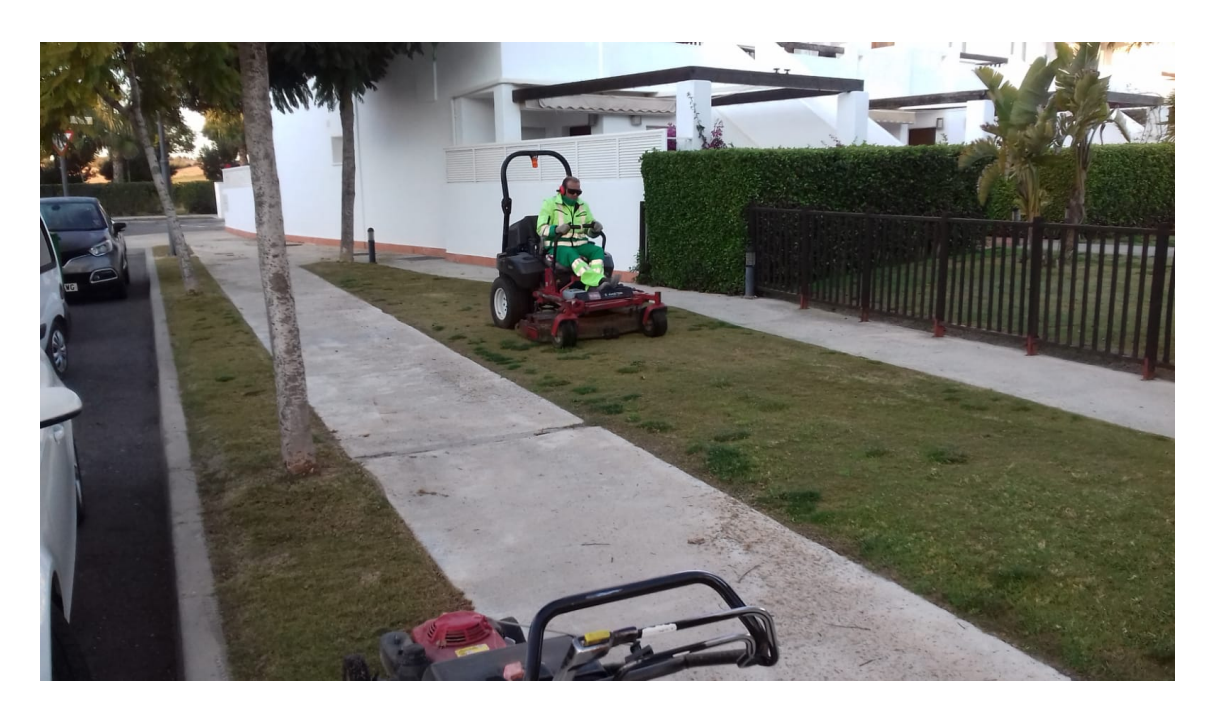
On the other hand, the oleander hedge trimming has been continued in Naranjos inner road.