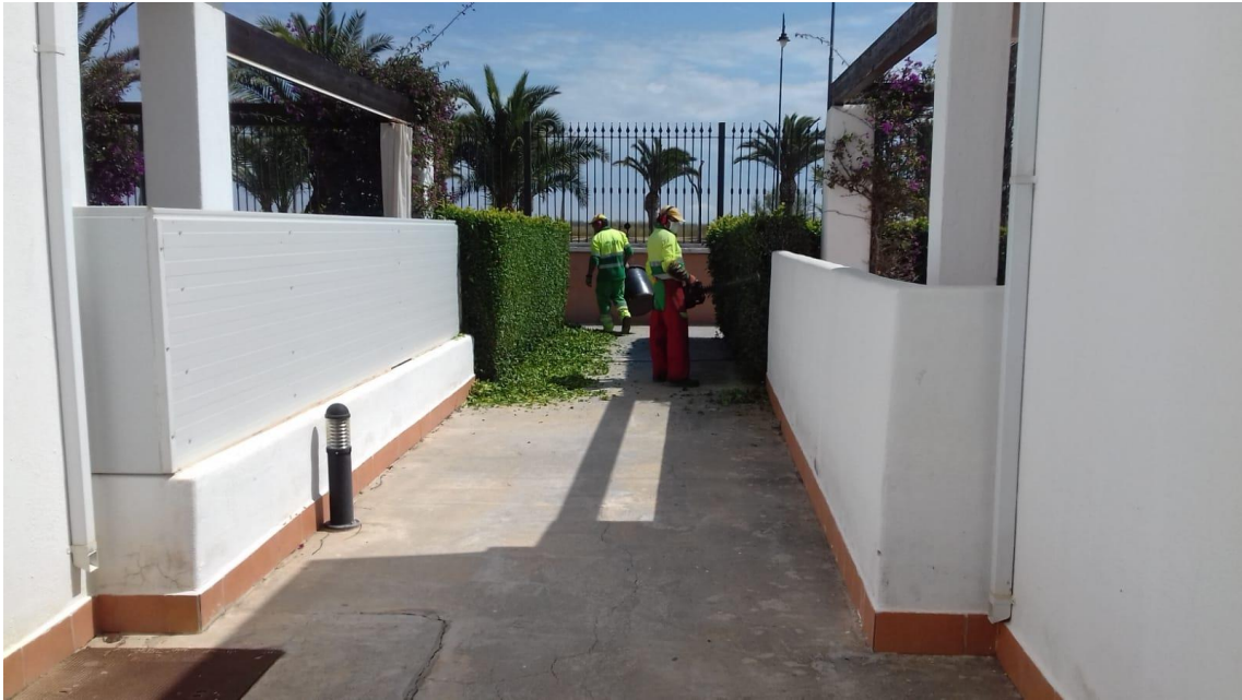
This week phytosanitary treatments have been carried out against 'psila' in Jardín 5 hedges and it has begun in Jardín 7.