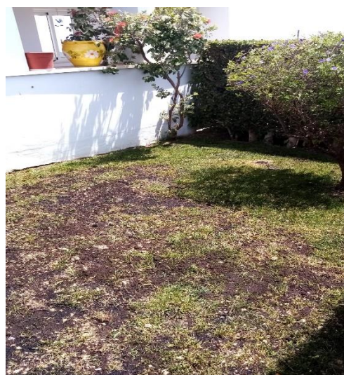
Images. Examples of freshly reseeded plots with "Cynodon dactylon" grass seed and "mulch" cover.